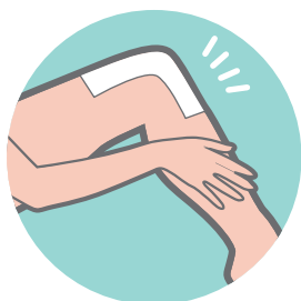
Used on joint skin